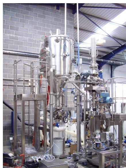
Brands & Trademarks: British Rema, Edgar Allen, Edgar Allen Aerex, Stag, Aerosplit, Microsplit